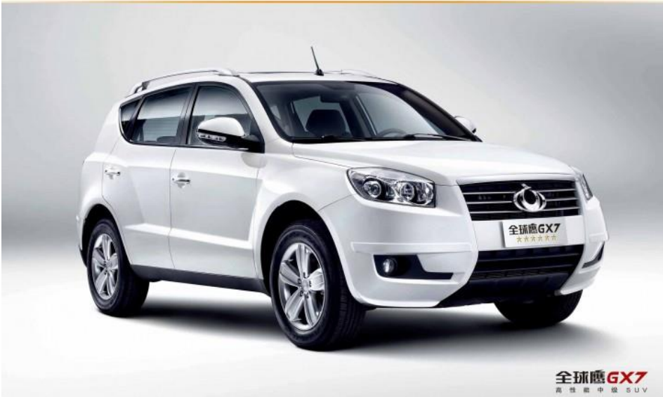
2013 version GX7