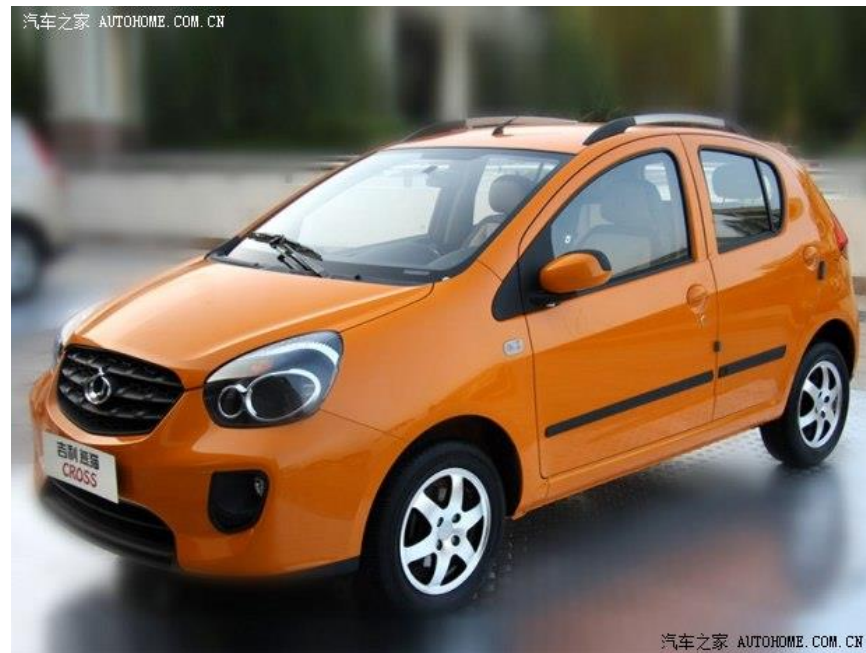
2014 Panda Cross