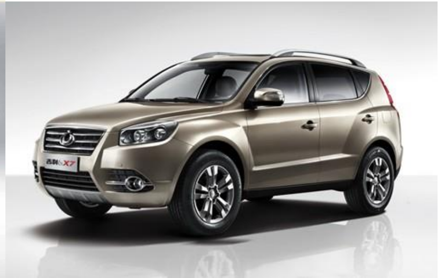
2014 version GX7