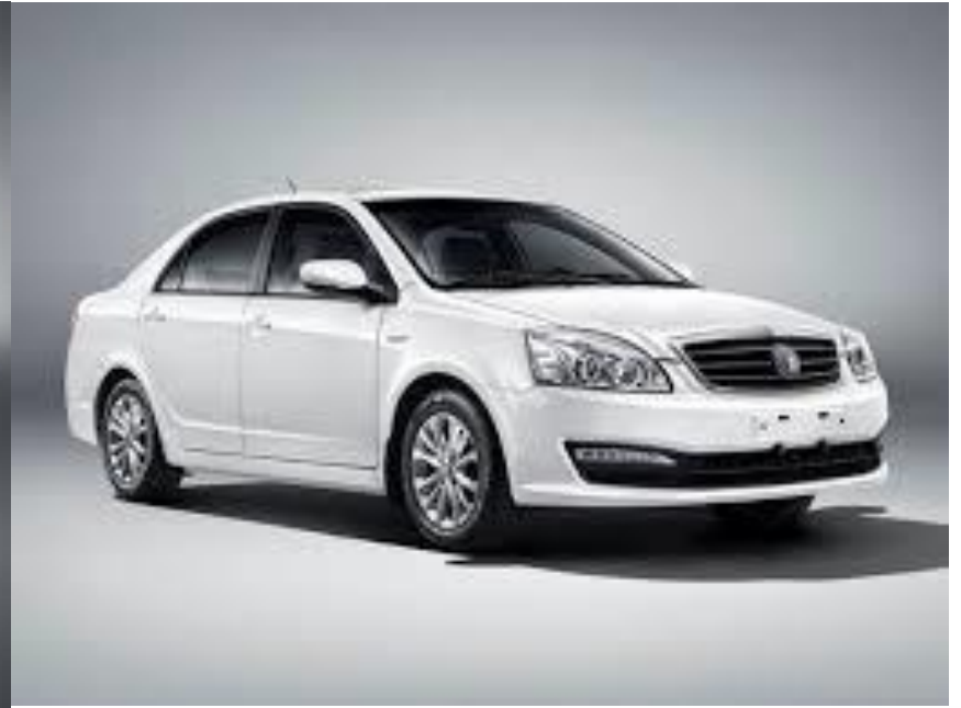
2014 version SC7