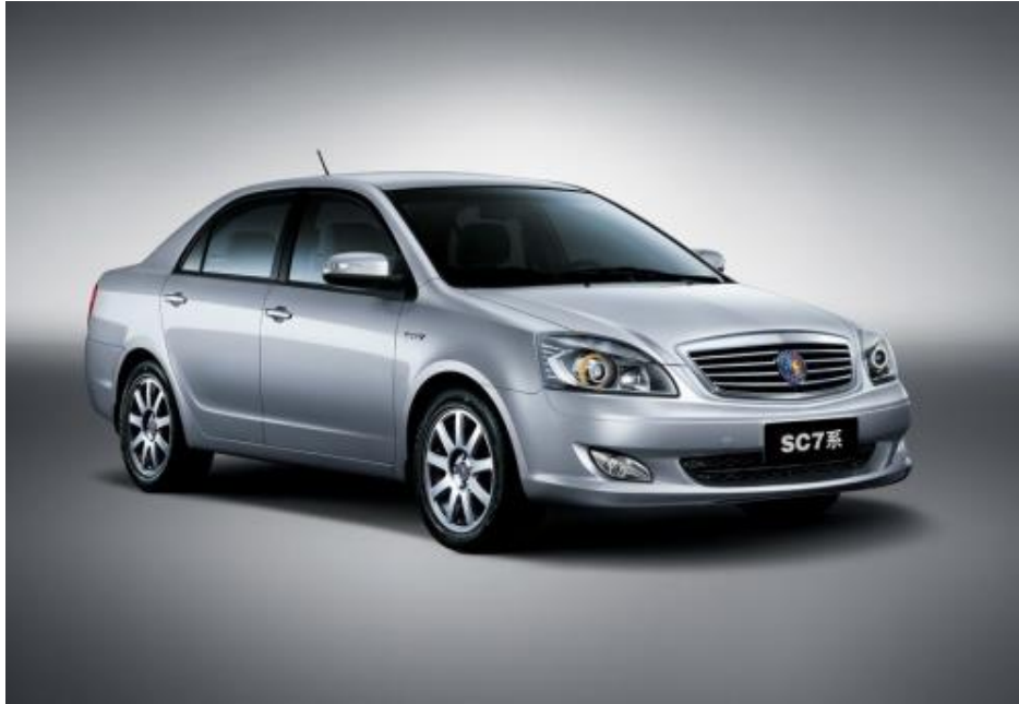
2013 version SC7