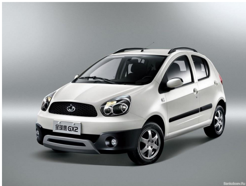
2013 version GX2